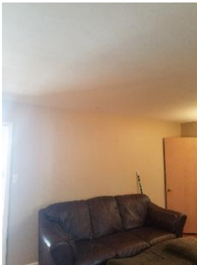
Area: Living Room Detail: Wall/Ceiling