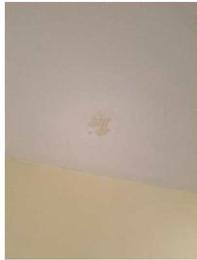
Area: Living Room Detail: Wall/Ceiling