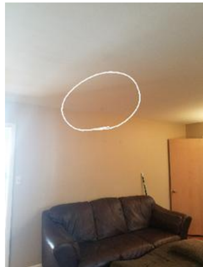
Area: Living Room Detail: Wall/Ceiling