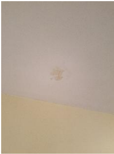
Area: Living Room Detail: Wall/Ceiling